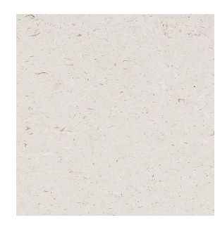
Heritage Portland Stone ®